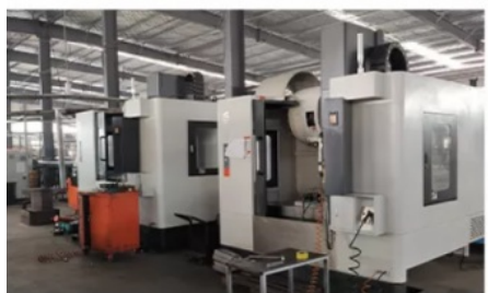
CNC MACHINING CENTER