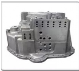
Lost foam casting