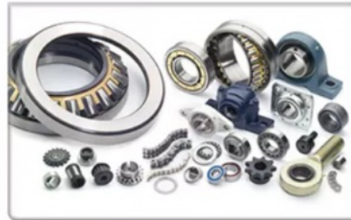
Motocycle &Auto parts