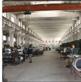
Ready For Machining