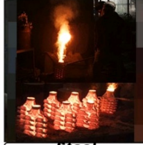
Steel Melting & Pouring