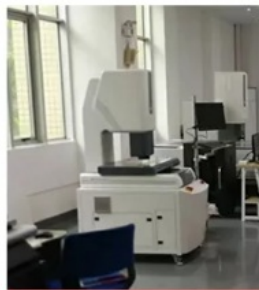
11. 3D Inspection