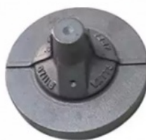
OTHER VALVE CASTINGS