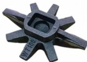
OTHER VALVE CASTINGS