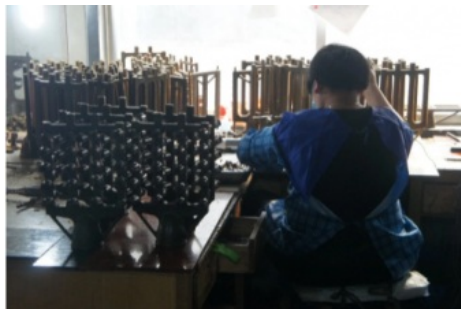
Factory Our Factory