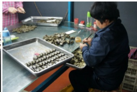
Workshop Our Workshop