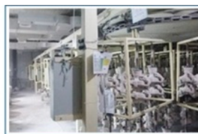
Shell making workshop