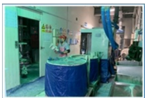
Shell making workshop