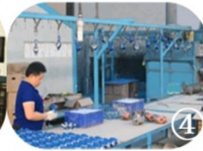
④ Surface Treatment