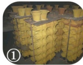
① Manufacturing mold