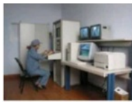
X-ray Detection Apparatus System