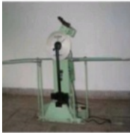
Impact Testing Machine Universal Testing Machine