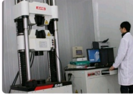
Tensile Test Machine