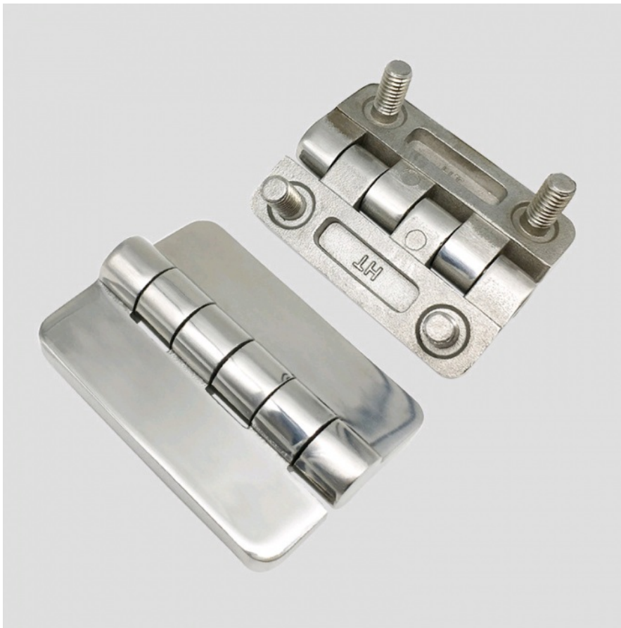
silicasol precision/investment casting process