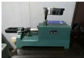
Hydraulic strength testing machine