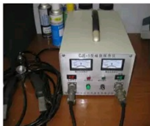
Magnetic defect detector