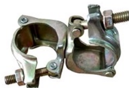
KOREA DOUBLE COUPLER