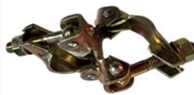
BRITISH DOUBLE COUPLER