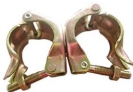
JIS SWIVEL COUPLER