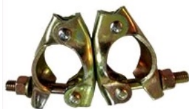
BRITISH SWIVEL COUPLER