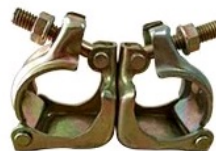
KOREA SWIVEL COUPLER