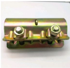
Pressed sleeve coupler