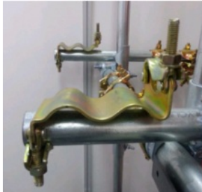
Pressed roofing coupler