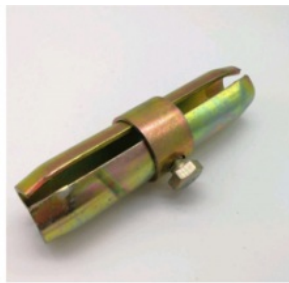
Pressed joint pin