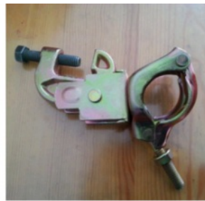
Jis beam coupler