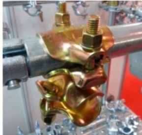
Italian pressed swivel coupler