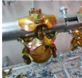
Italian pressed double coupler