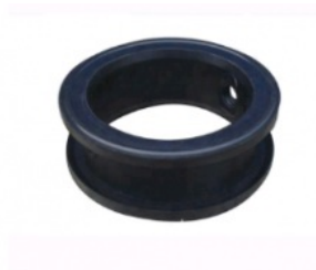
Chinese Factory price Hard seal butterfly valve seat ring