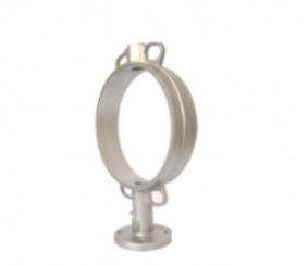
High performance steel butterfly valve body