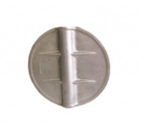
High-performance compressor butterfly valve plate assembly