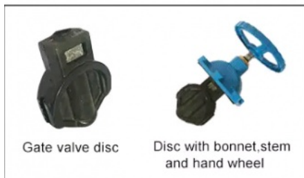
Gate valve disc