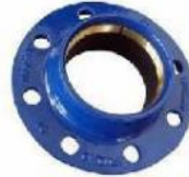
F-103 Push on flange adaptor for PE pipe, with brass pipe lock