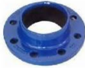
F-102 Push on flange adaptor for PVC pipe