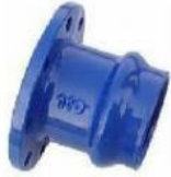
F-101 Flange Adaptor (Flange Socket Piece)