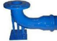
F-105 Flange Socket 90deg Duckfoot Bend