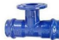
F-107 Socket Flange Tee