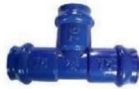
F-106 All Socket Tee