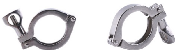
13MHHS 3-Segment Heavy Duty Clamp